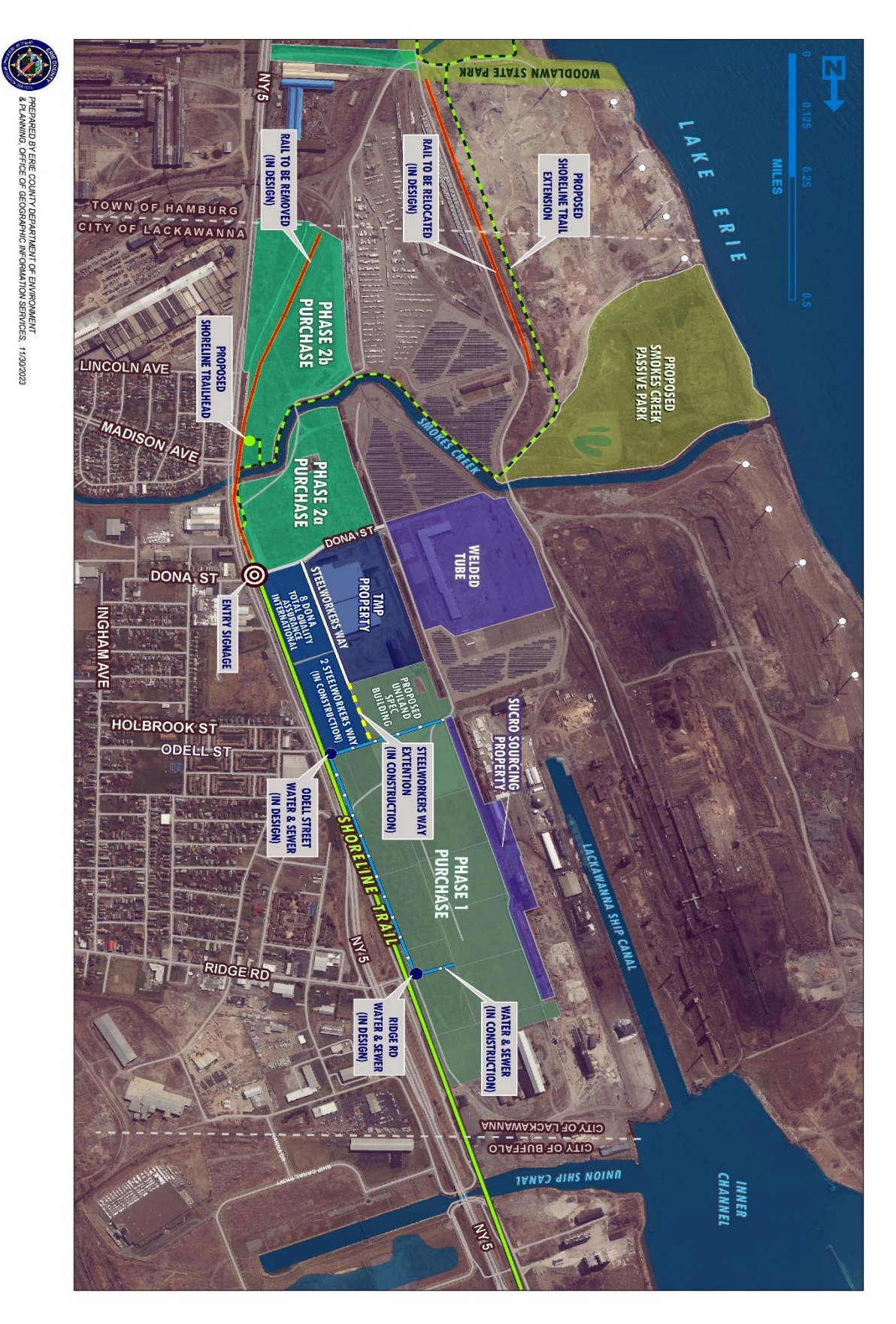
Page 19 of 19